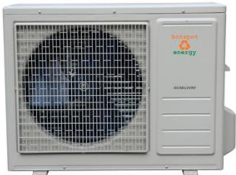
ODU (Outdoor Unit)

Variable Refrigerant Flow & Capacity means that the air conditioner is always the right size for the conditions and is never wasting power. This unit uses utilizes SeaSpray™ anti-corrosion technology including hermetically sealed compressor, sealed circuit boards, and silica-nanotech condenser and evaporator protection. A product of HotSpot Energy, a trusted name in specialty air conditioning manufacturing and renewable energy.