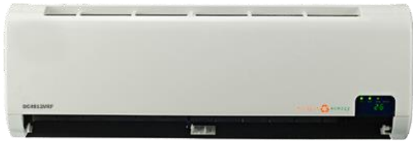
Wall Mount Indoor Unit (IDU)

12,000 BTU 48V DC Heat Pump VRF Dynamic Capacity Compressor 100% DC - No Inverter